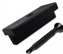
6mm MOUNTING CLIP

46 x 14mm black electro plated concealed stainless steel mounting clip