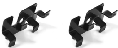
3 MM MOUNTING CLIP

46 x 14mm black electro plated concealed stainless steel mounting clip