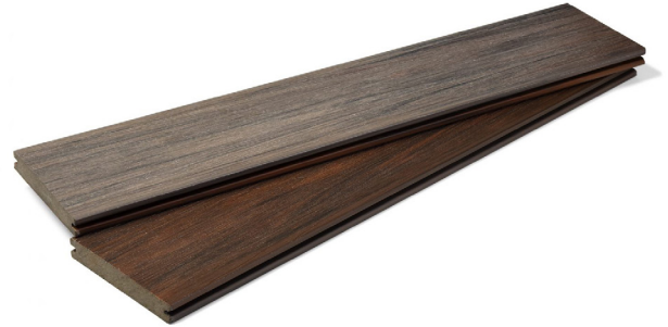
BURNT OAK/COPPERED ELM