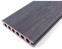
GREY (3600 x 140 x 23)