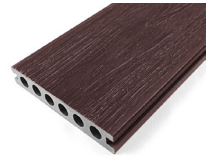
WALNUT (3600 x 140 x 23)