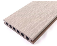
ANTIQUE (3600 x 140 x 23)