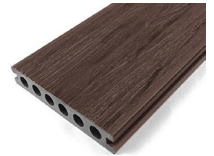
COFFEE (3600 x 140 x 23)