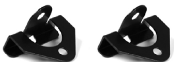
STARTER CLIP 36 x 24mm black electro plated stainless steel starter clip.