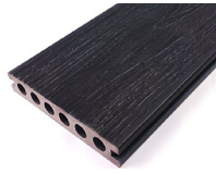
BLACK (3600 x 140 x 23)