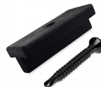
6mm MOUNTING CLIP 40 x 19mm black plastic mounting clip