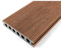
TEAK (3600 x 140 x 23)