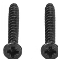
WOOD SCREW 4 x 35mm black electro plated stainless steel wood screw.