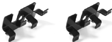
3mm MOUNTING CLIP 46 x 14mm black electro plated concealed stainless steel mounting clip